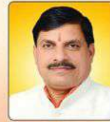
Dr. Mohan Yadav

Hon'ble Governor of Madhya Pradesh & Visitor of the University