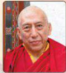
Venerable Prof. Samdhong Rinpoche

Hon'ble Chief Minister of Madhya Pradesh & Chairman, General Council of SUBIS